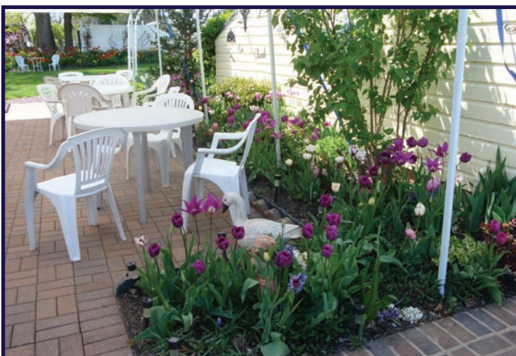
Special Event Space